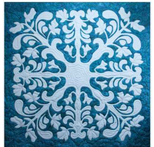
Pacific Rim Quilt Company Blog pattern

Please check the website for the most recent video describing in detail the keynote speakers and some of the workshops and more of the fun events planned for this unique cruise—first of its kind for our guild. This special cruise is available for guild members only. The crew of the Nautical Needle is so excited about this virtual trip—and we know you will be too! It is our hope that this will be a fun quilting events in the middle of the cold winter. Be sure to register early so you are included all the communications, including a private Facebook group for this special cruise.