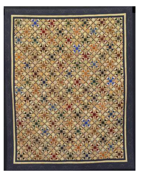
Bed/Lap Quilts Omigosh (66.5" x 82.5") by Sandy Campbell