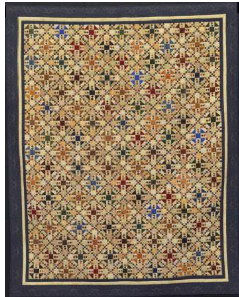
Bed/Lap Quilts Omigosh (66.5" x 82.5") by Sandy Campbell