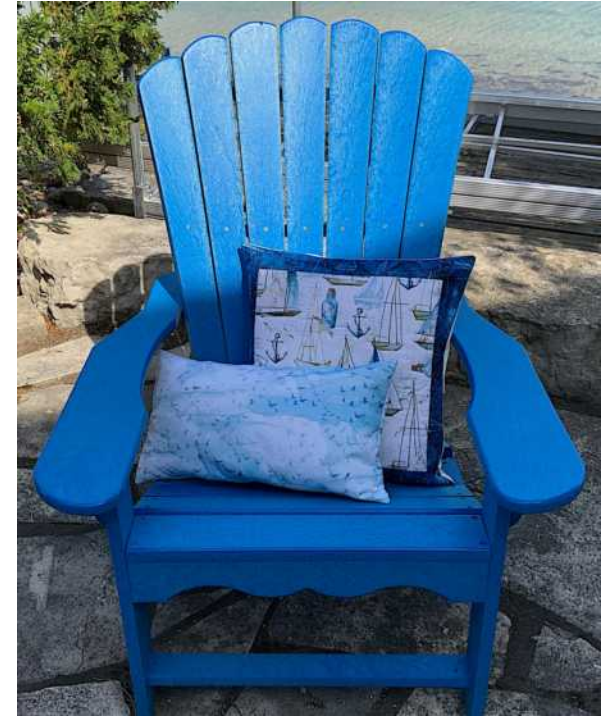
Matching throw pillows